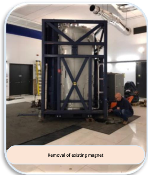
Removal of existing magnet

Tel: (024) 76 466 877 Fax: 08721 130782 e-mail: admin@chielcon.co.uk web: www.chielcon.co.uk