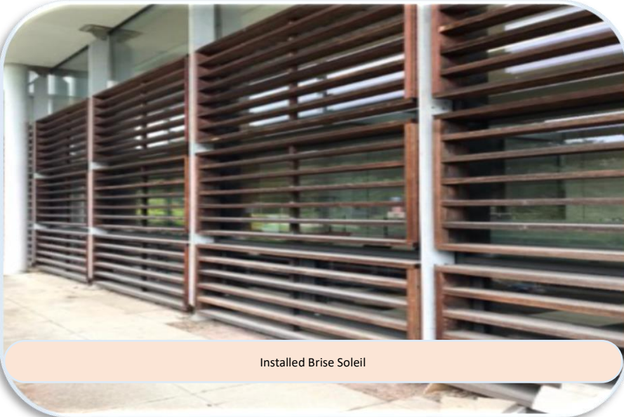
Installed Brise Soleil