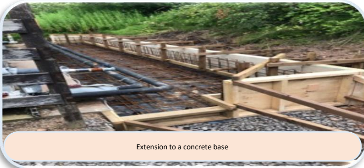
Extension to a concrete base