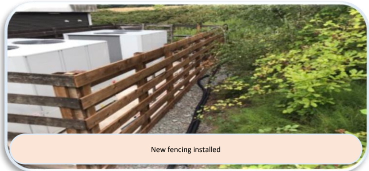
New fencing installed