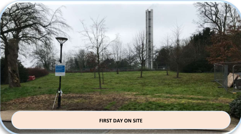
FIRST DAY ON SITE